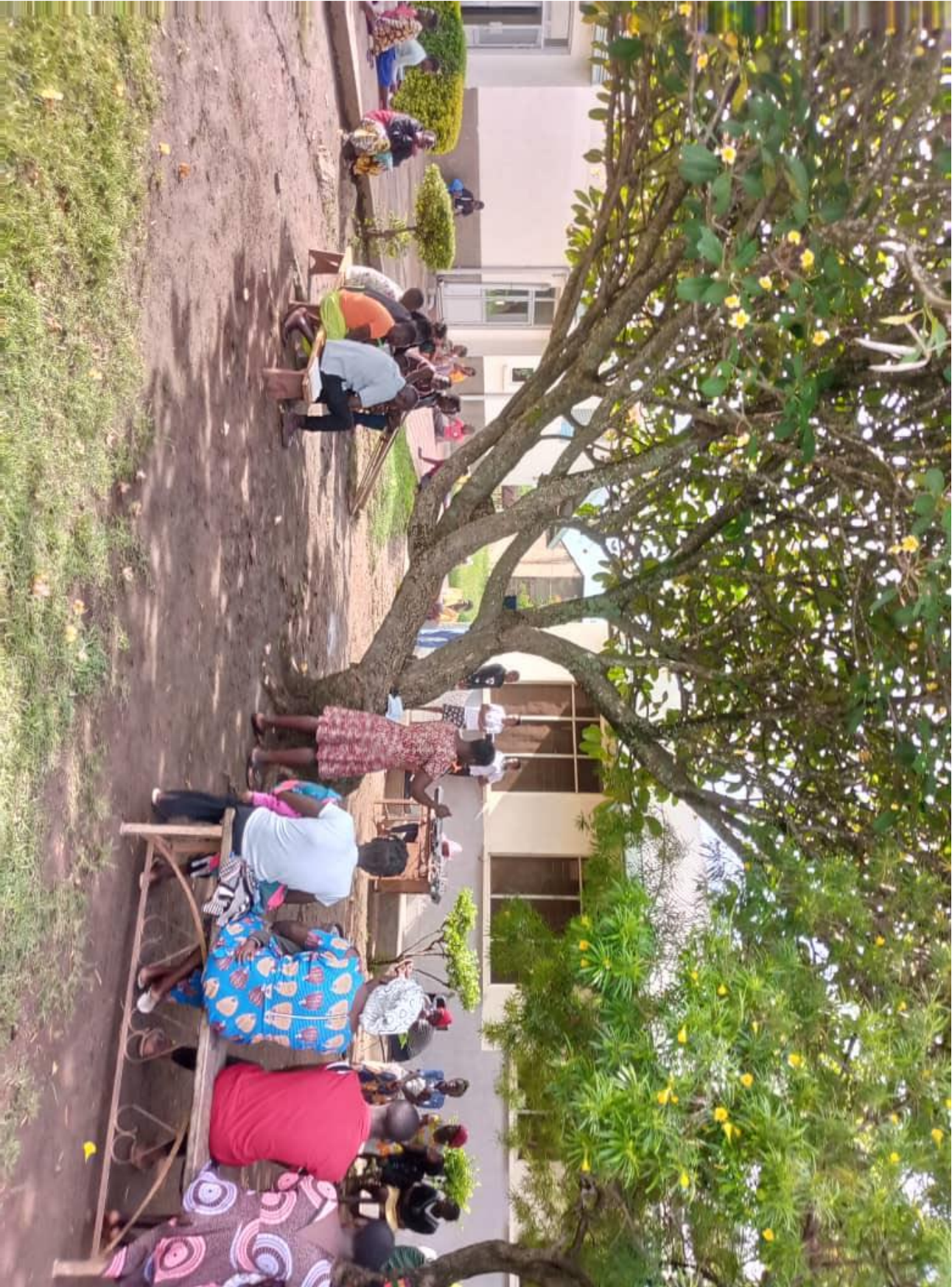
Kumi Hospital Parish Youth Chair/P expressing her Views over the Topic of research.